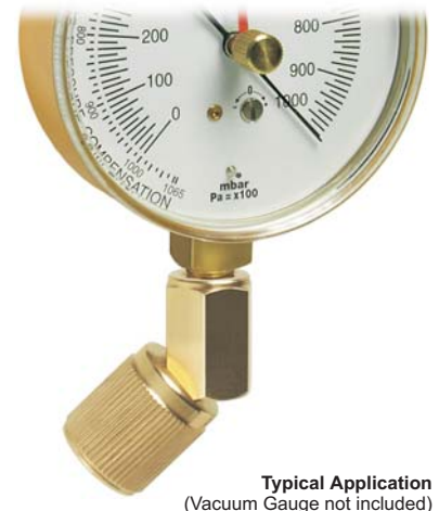
Typical Application (Vacuum Gauge not included)