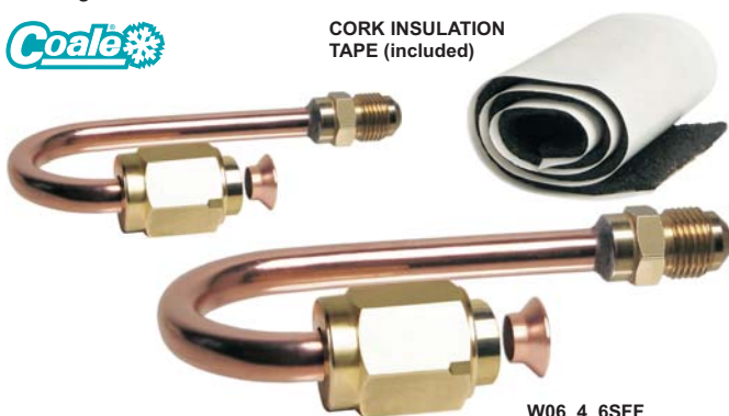
W06 4 6SFF