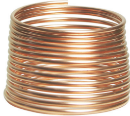
TC- 59-10 (3,0 m.)

Only five sizes of capillary tubing are needed to fit any 1/8 to 2 HP commercial and domestic refrigerator or RAC Room Air Conditioner. • Replace any original capillary tubing; • ID within \pm 0,001'' ( \pm 0,025 mm.); • Conforms to ASTM B360-88 Specifications (Except Model TC-59).