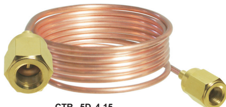
CTR- 5D 4-15

• For all CFC, HCFC, HFC, HFO refrigerants (except Ammonia R-717); • Soft copper capillary tube 0,059'' (1,50 mm.) ID Inside Diameter x 0,112'' (2,84 mm.) OD Outside Diameter; • Reusable, long lasting, 1/4'' (7/16'' 20UNF) or 5/16'' (1/2'' 20UNF) Female SAE Flare swivel nut with replaceable B3 Long Tan Copper Gasket and Depressor.